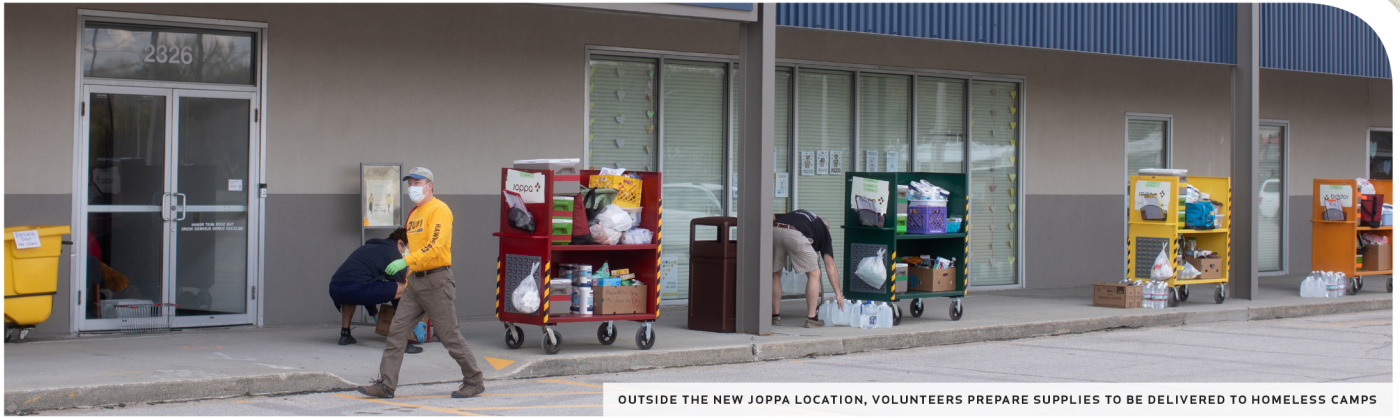
OUTSIDE THE NEW JOPPA LOCATION, VOLUNTEERS PREPARE SUPPLIES TO BE DELIVERED TO HOMELESS CAMPS