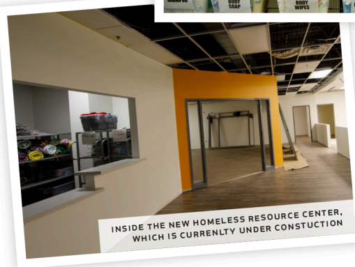
INSIDE THE NEW HOMELESS RESOURCE CENTER, WHICH IS CURRENTLY UNDER CONSTRUCTION