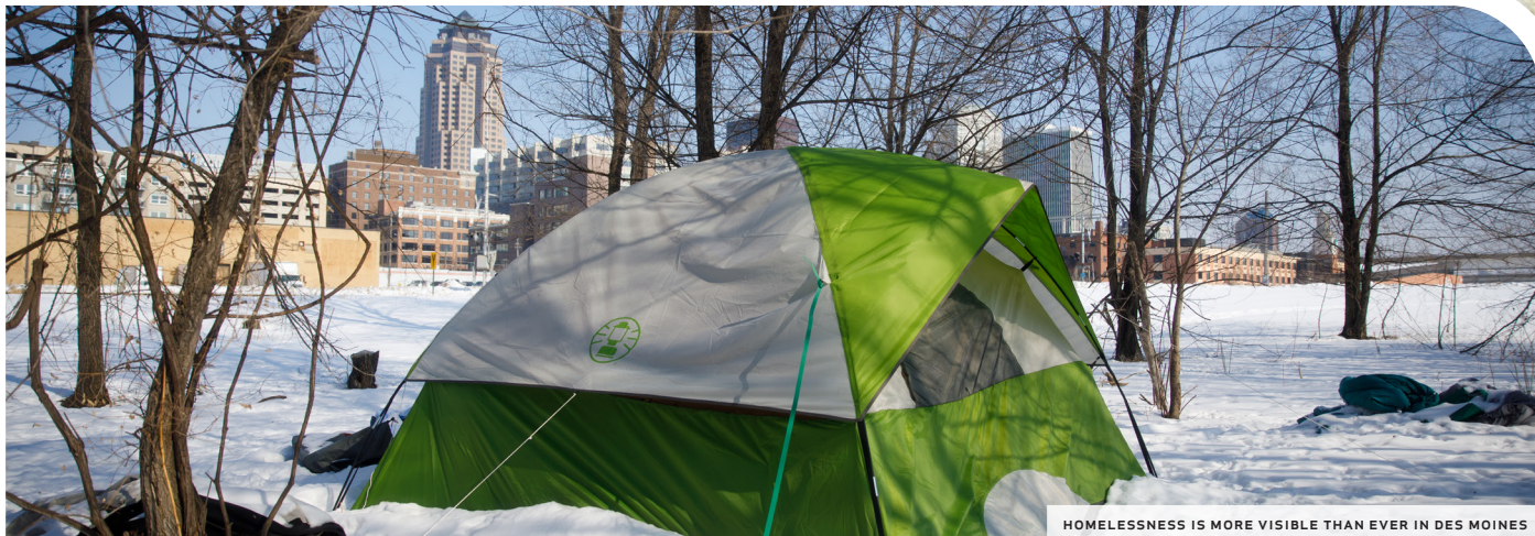
HOMELESSNESS IS MORE VISIBLE THAN EVER IN DES MOINES