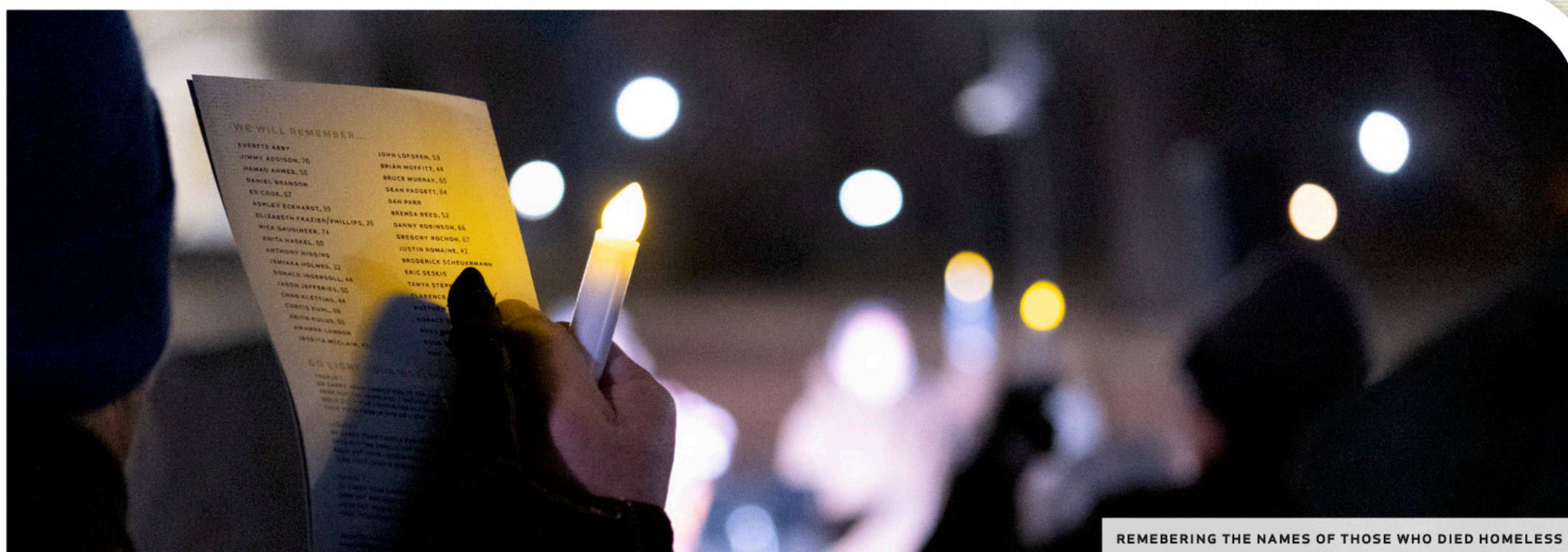
REMEMBERING THE NAMES OF THOSE WHO DIED HOMELESS